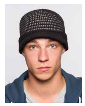
No fashion hair covering