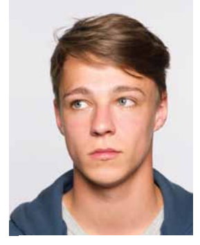
Dont look away from camera