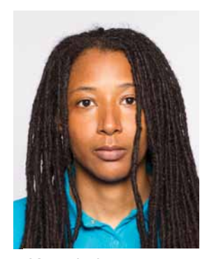
Keep hair off face