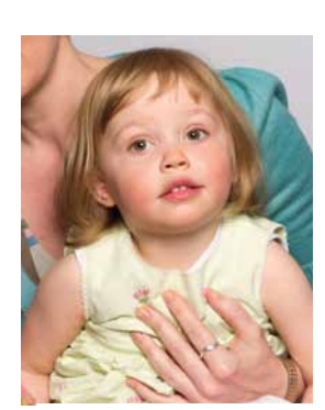
1 person only in photo