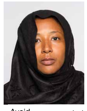
Avoid covering face